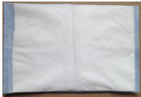
Photo 1- Absorbent Pad