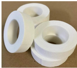
Photo 1 --- Nonsterile Adhesive Tapes