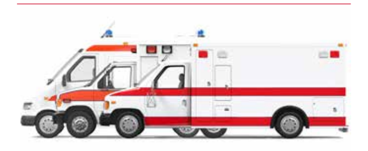
Scalable to Any Size Vehicle

• Improved Inventory Control SafePaks and pouches make inventory control easier with better visibility of supplies, reducing duplication, waste, and expired supplies.